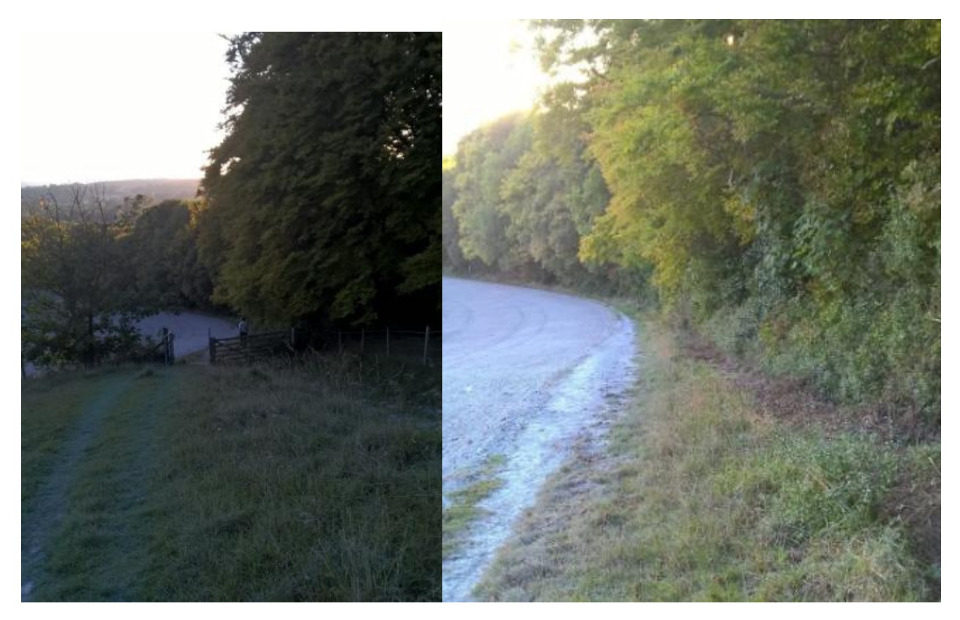
7 New path