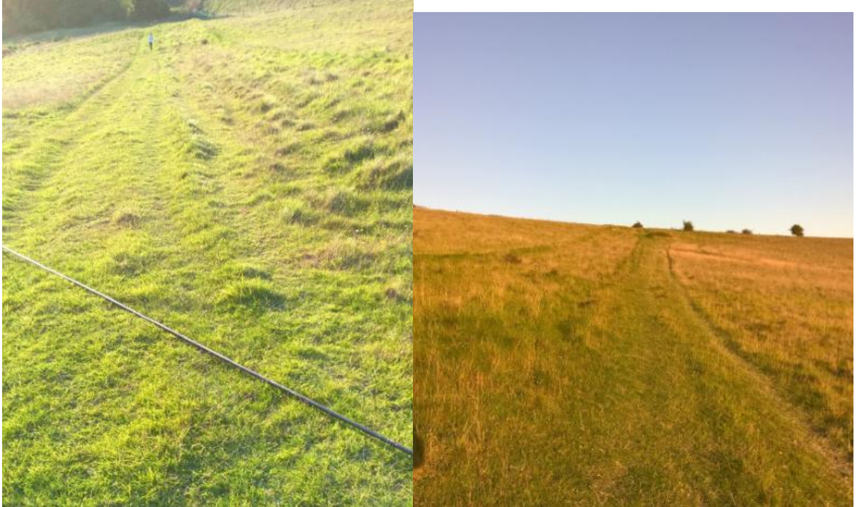
4 New path