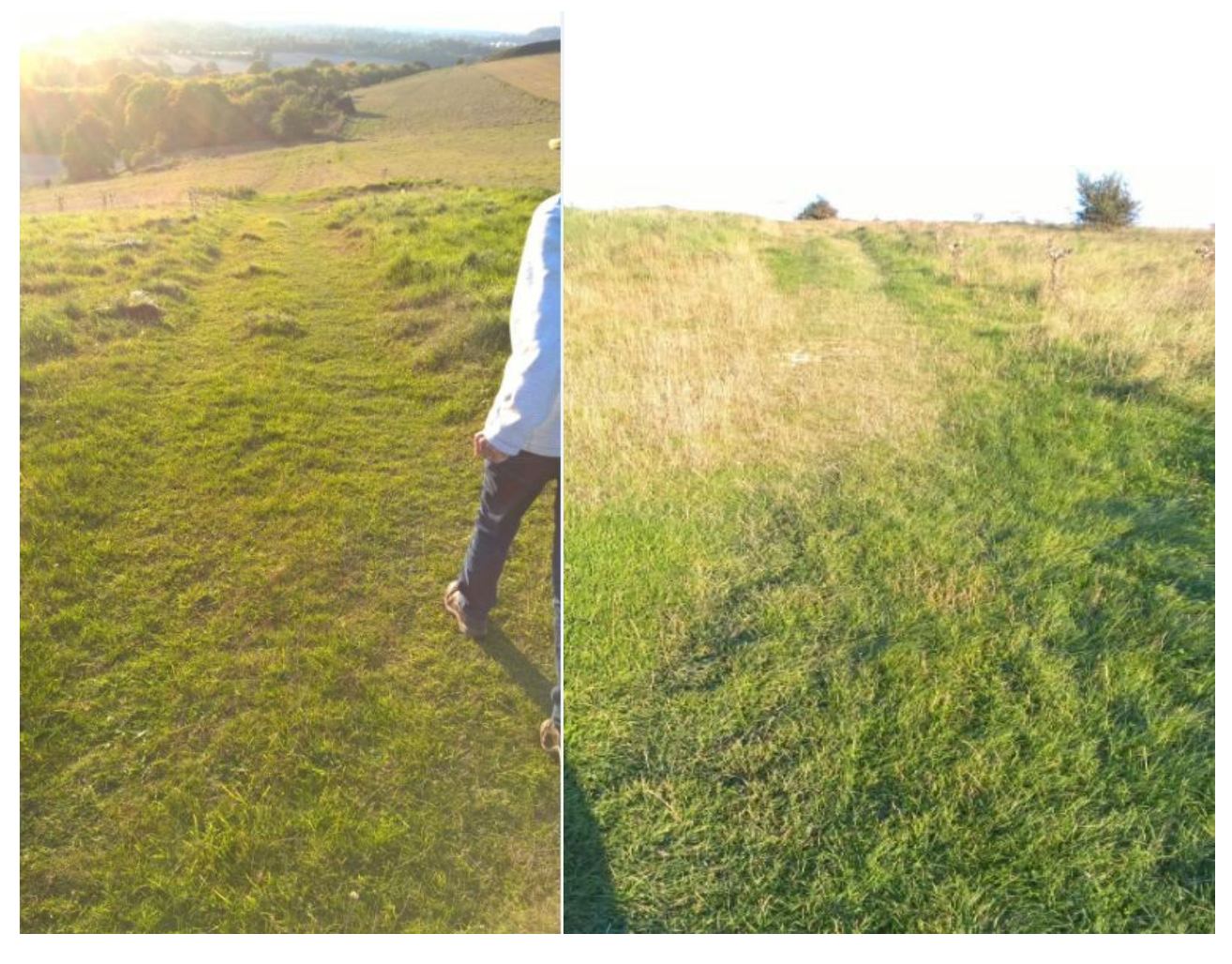
3 New path