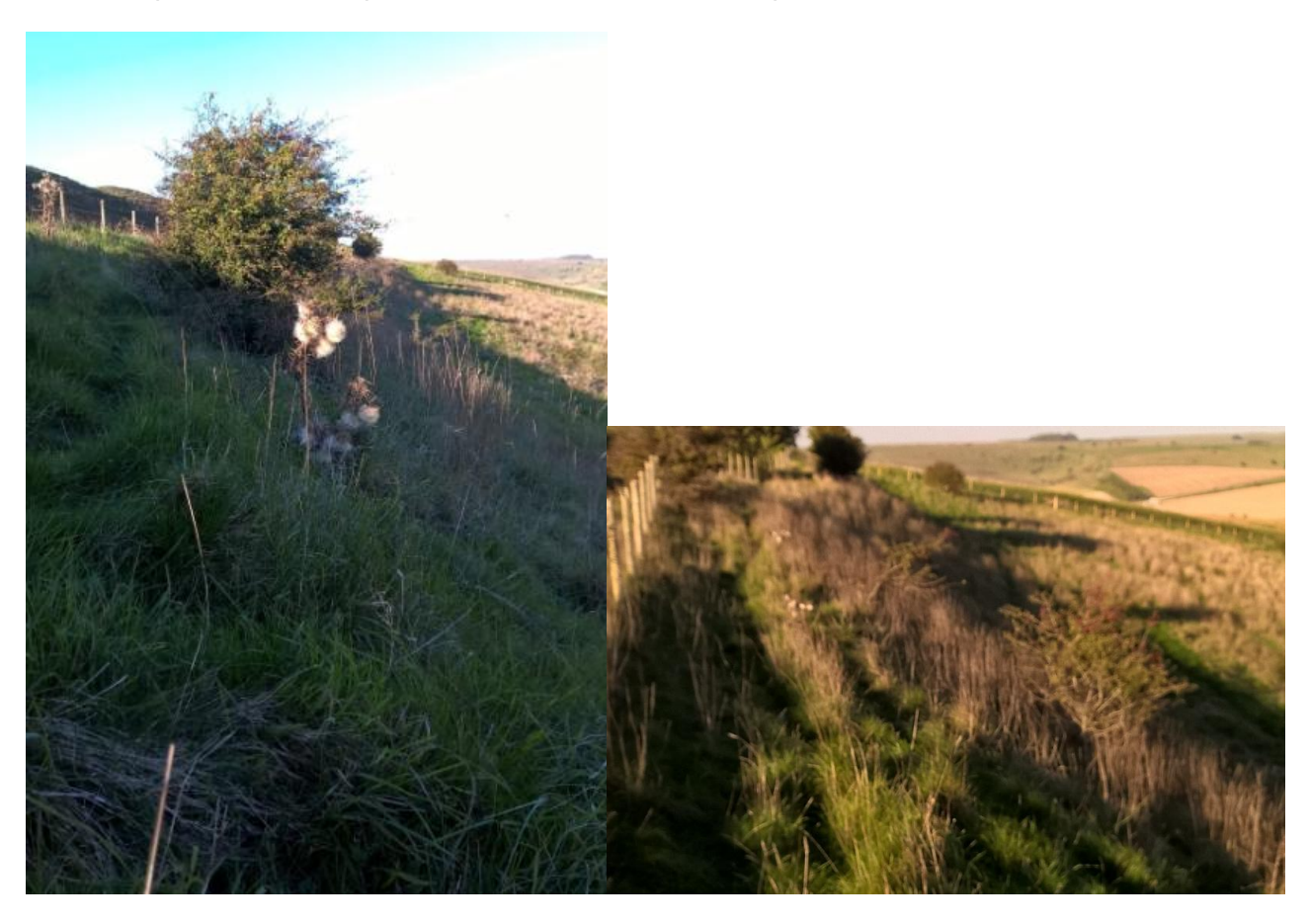
10 Current line of path